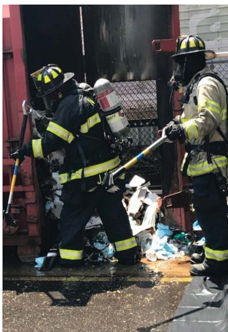
Firefighters extinguishing the roll off fire

For more information or assistance in answering any questions you may have regarding lab trash, please contact Environmental Health and Safety at 302-831-8475.