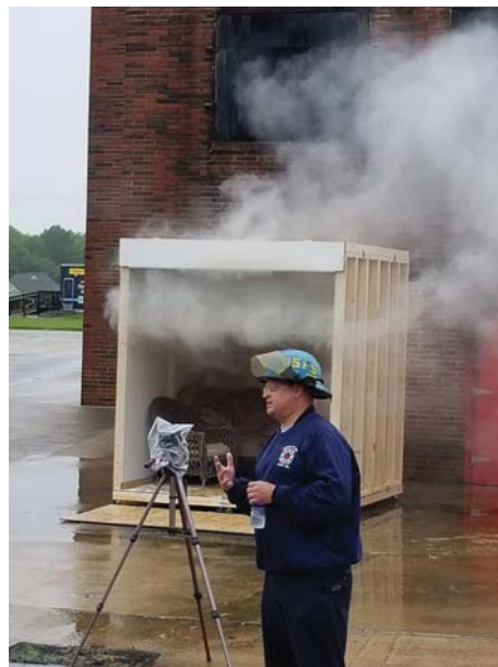
This sprinkler protected moderately furnished room at the 30-second mark where a single sprinkler head activates and contains the fire. This is a survivable event that contained the fire to one room.

For more information on fire sprinklers and fire safety, please contact Environmental Health and Safety at 302-831-8475.