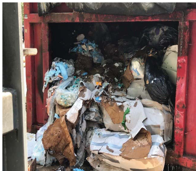
Burned remains of trash inside the roll off following the fire