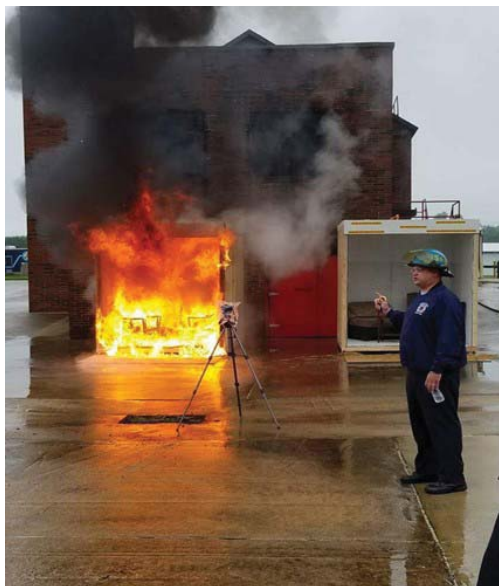
A moderately furnished room without sprinklers at the 3-minute mark. The room is beyond survivability and would be threatening the entire home at this stage.

For more information, please see this link: www.firesprinklerinitiative.org/Delaware